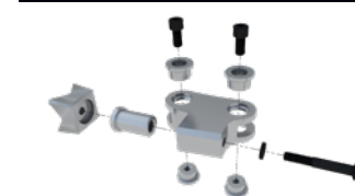
Shown with 2-Piece Tooth