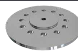
Unique "disc clamping" design